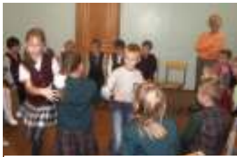
Upset the Fruit Basket