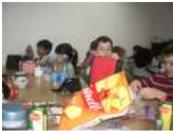
Lunch at Int'l Academy