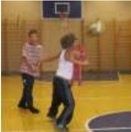
Volleyball practice #23