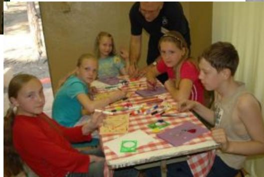
Craft Activities at Camp