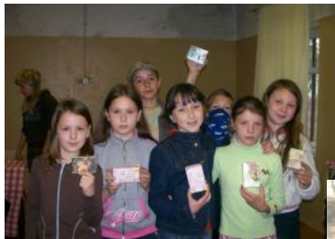
Boxes from Greeting Cards