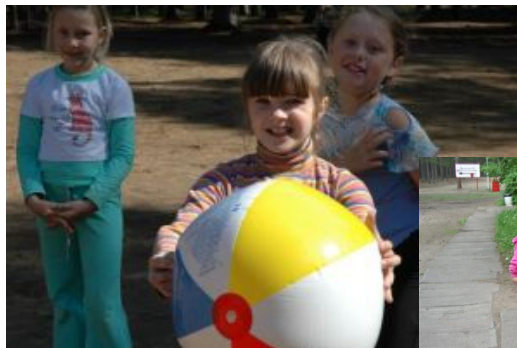
Fun at Camp Horizon