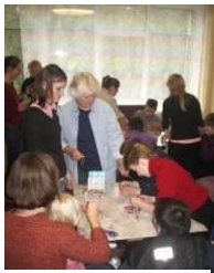
Stringing beads Peterhof 3

The costs of this testing and documentation can be $50.00 or more per person. This is very expensive for these girls so their visits have been suspended. We would like to help getting them back into the orphanages by providing the funding for these tests and documentation. The MIR staff has told us that they can help with getting the documentation. Would you pray about providing some financing to help these girls? Do you know of others who need this help as well?