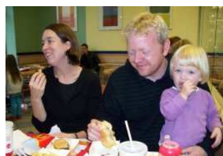
Ahhh, comfort food!!!