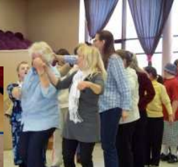
Games at #7 Adult Facility