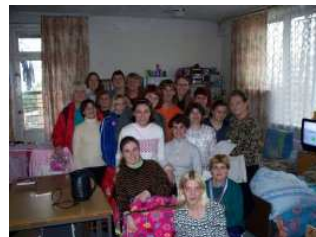
Visiting at #10