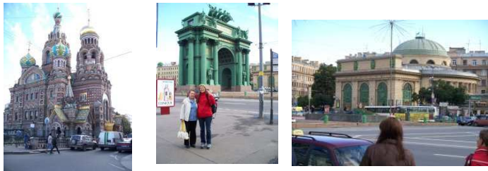
Scenes from St. Petersburg.

The Children in Common knitting society who sent things for the September trip are again willing to send things for us to take in January. If you plan to go, please keep one suitcase available for these wonderful knit sweaters, socks, hats and mittens.